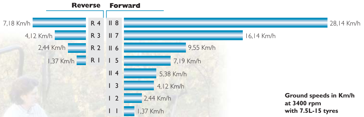
Ground speeds in Km/h at 3400 rpm with 7.5L-15 tyres