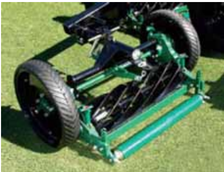
Sportster: 6 blade low-profile cutting reel, used in conjunction with a rear roller