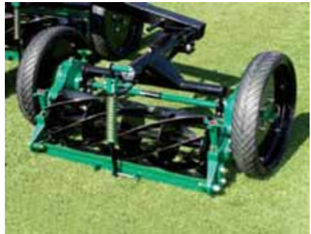
Parkster: 5 blade 10 inch cylinder, used without a rear roller for semi-rough applications.